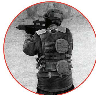
Trijicon Electro Optics 12µm, 640x480 @ 60Hz