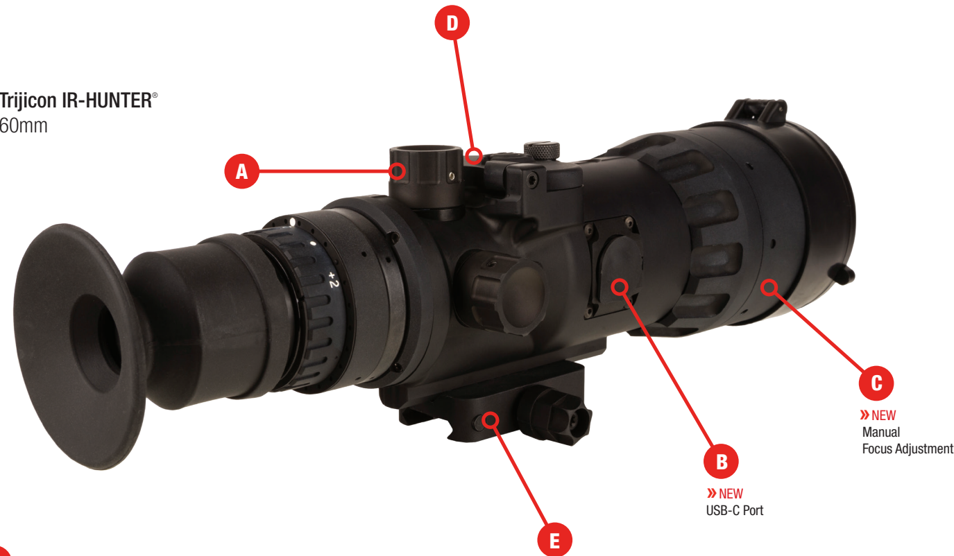
Trijicon IR-HUNTER® 60mm